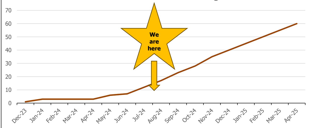
Sites needed to reach target

We are slightly behind our NIHR target for number of sites open and patients recruited, we are encouraging all sites who are not yet open to do so as soon as they can to help us reach our targets. If you have any questions from an operations perspective or from R&D please do reach out to us, we can help!